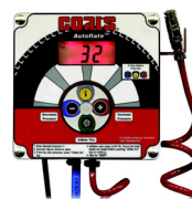
Digital Inflation 85009184