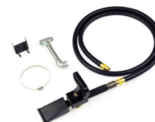
Auxiliary Bead Sealer 85606545