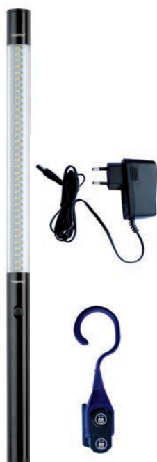
ULTRA SLIM DESIGN FA5702

ORDER NOW AND LIGHT YOUR WAY TO GREATER PRODUCTIVITY AND PROFIT!