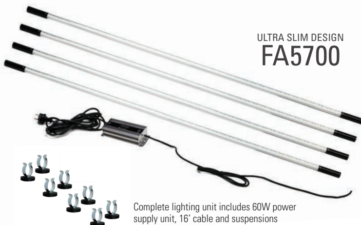
ULTRA SLIM DESIGN FA5700

Complete lighting unit includes 60W power supply unit, 16' cable and suspensions