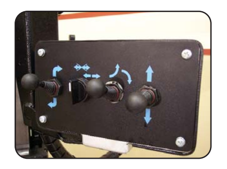
Operator control panel.