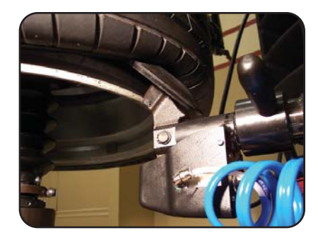
Locking disc position is quick and accurate on both sides of tire.