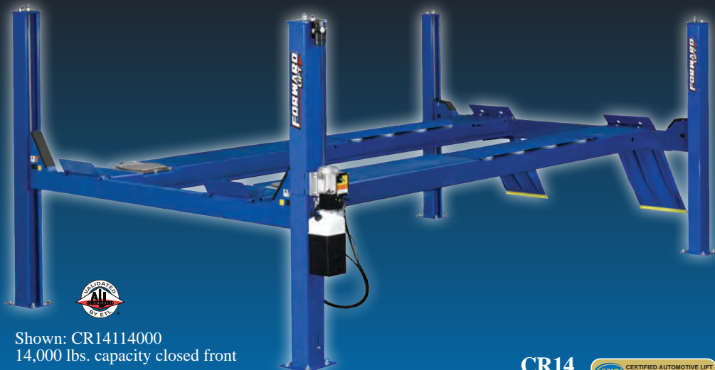
Shown: CR14114000 14,000 lbs. capacity closed front

Shown with optional bolt-on alignment kit and radius gauges