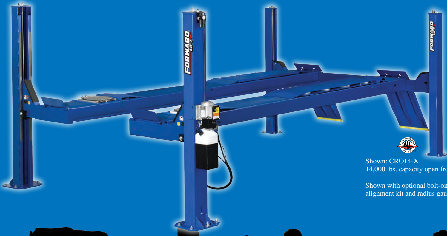
Shown: CRO14-X 14,000 lbs. capacity open front

21st century design tools allow us to create, control and validate our designs to ensure maximum performance. Forward lifts are rigorously tested to meet quality and durability standards. All product families are proof load tested to 1½ times rated capacity and rigorously cycle tested.