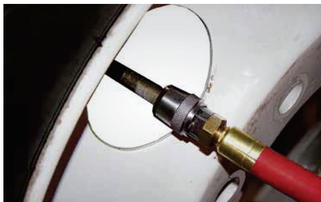
OTR valve for MIC-AUHD78 and MIC-AUHD82