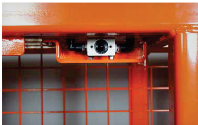
Safety Air Valve on each door