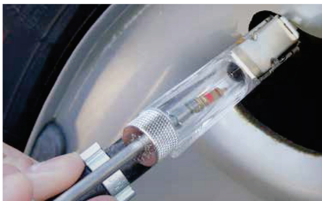
Core Valve Remover for MIC-AUHD52