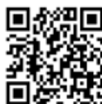
Preparing for a battery test