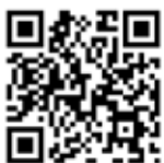
Features and benefits

Use your smartphone QRC scanner app to view these EXP-800 videos: