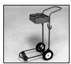
The optional transport cart makes it easy to move the AquaSpot<sup>®</sup> and cleaning supplies from one area to another

Optional transport cart carries hose, cord, tools and cleaning accessories Detachable power cord for ease-of-use Built-in handle makes carrying easy Recovery tank lifts off for easy emptying. Has