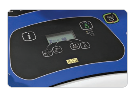
Simple, intuitive controls minimize operator training.