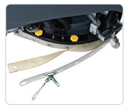
Squeegee wraps around the deck for 100% water pick-up and simply clips onto the bracket with no thumb nuts or adjustment required.