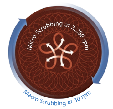
REV model only – Patent-pending REV™ random orbital scrubbing technology with high-speed, ¼-inch micro scrubbing and rotational, low-speed macro scrubbing attacks dirt from multiple directions for superior cleaning effectiveness.