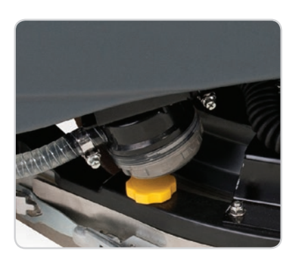
Externally mounted solution filter allows operators to easily clean the filter and manage the solution level.