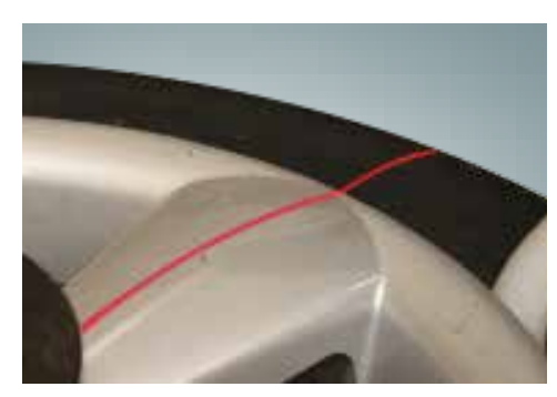
Smart Vision Wheel and Tire Profiling