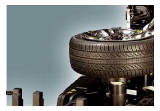
Intelligent Wheel Lift