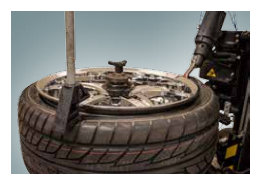
Integrated Bead Pusher