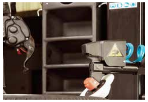
Convinent Storage Compartment