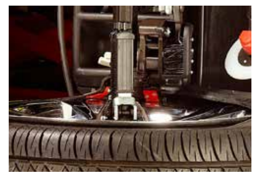
Quick Fit Center Wheel Clamping