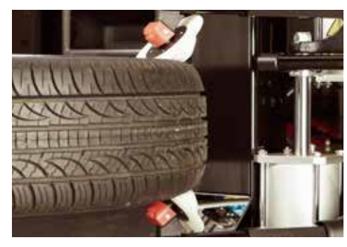
Dual Bead Breakers

• Quick and safe top side bead seating and inflation included