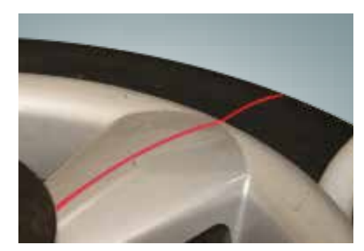
Laser Positioned Tooling