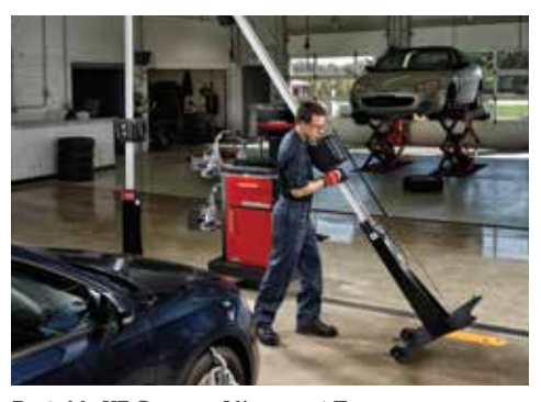
Portable XD Camera Alignment Towers