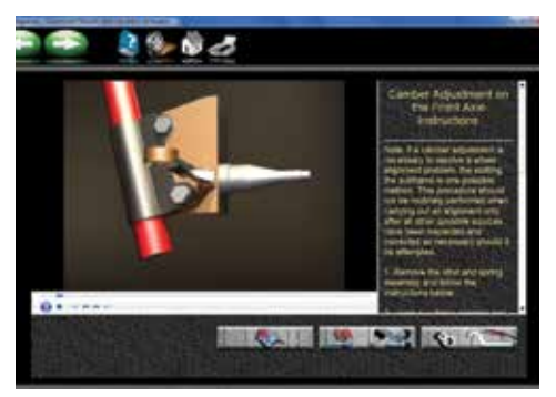
Easy to follow Help Videos