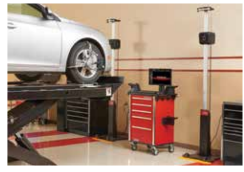
Automatic Vehicle Height Tracking